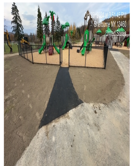
UPK Playground Paving