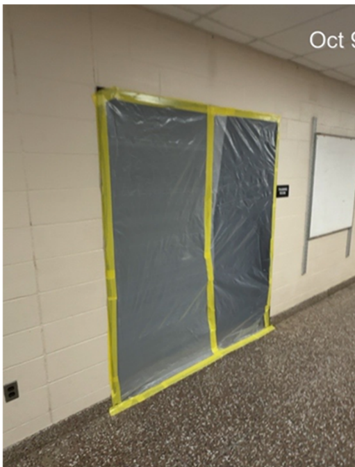
Dust Barriers Constructed