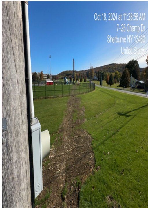
New Power ran and connected to scoreboard