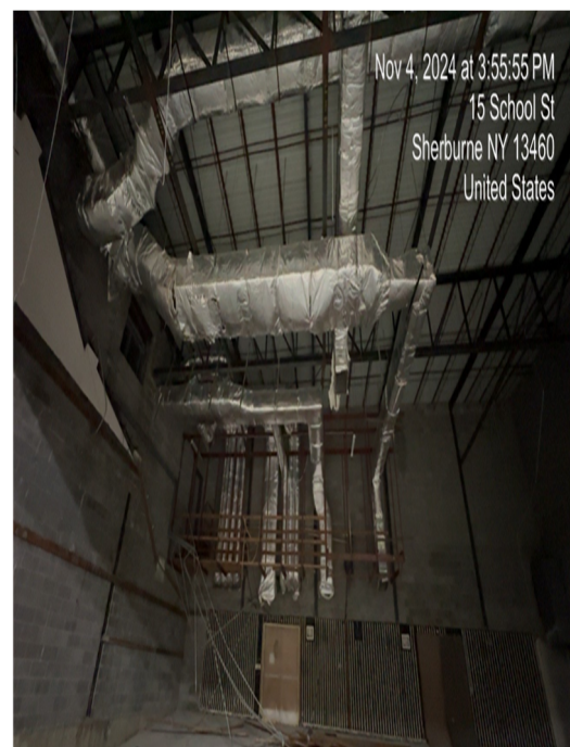
Auditorium Plaster Ceiling Removal