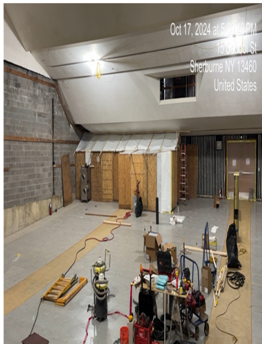
Vermiculite Abatement above Plaster Ceiling