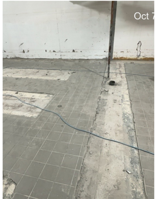
Demolition of Existing Locker Bases