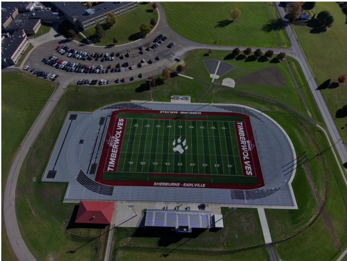
Completed Field Aerial View