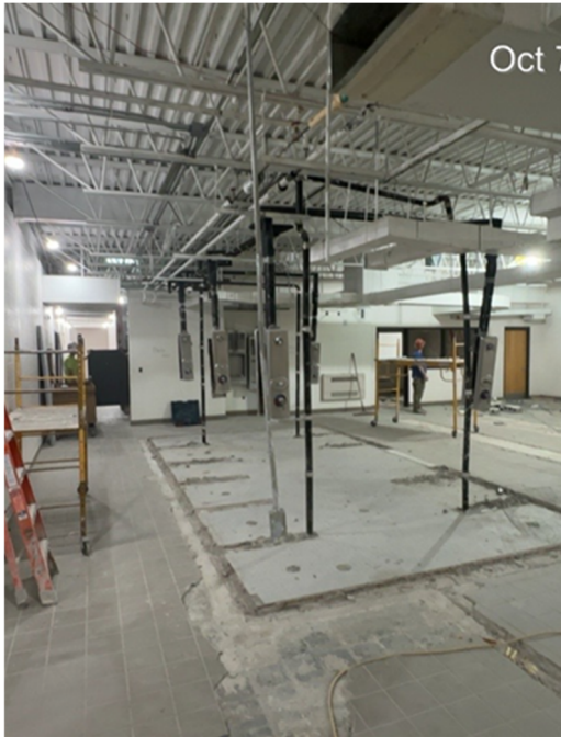
Demolition of Block Walls and Plumbing