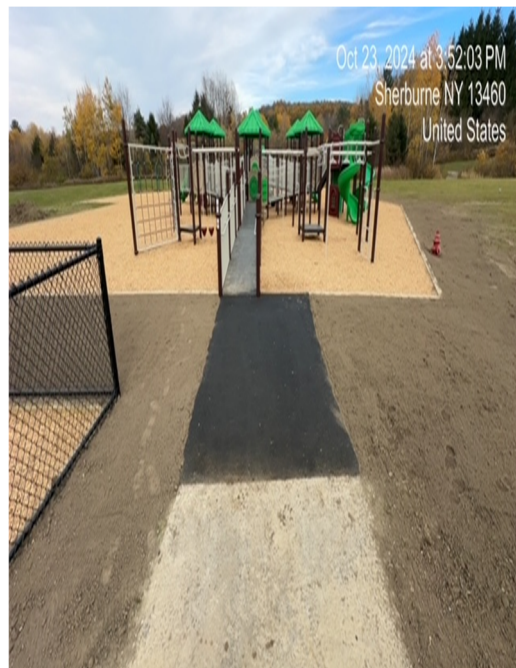
Elementary School Playground Paving