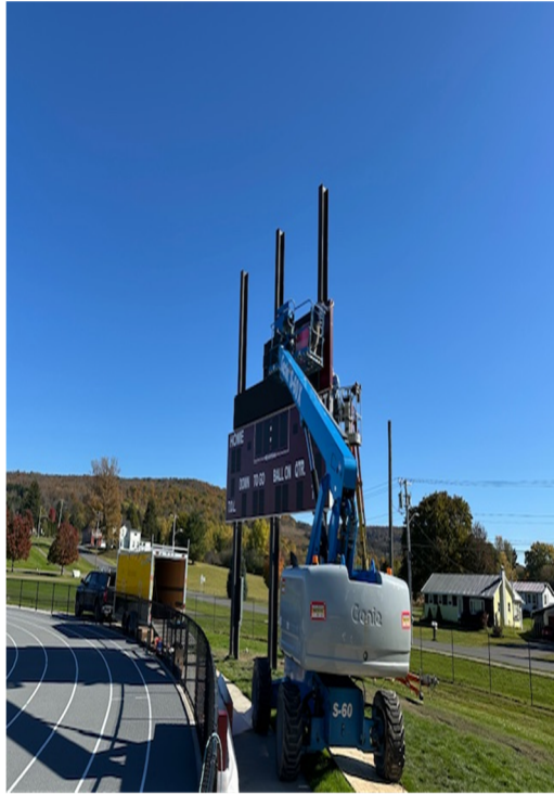
New Scoreboard Installation In Progress