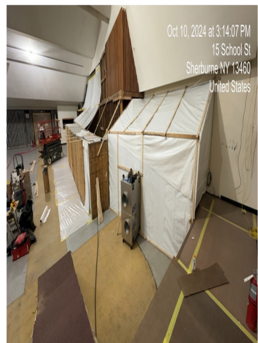
Vermiculite Abatement along West Wall