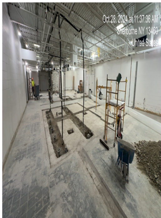
Slab Cut out and Excavation South Locker Room