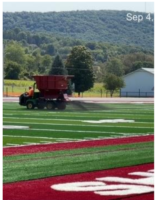
Installing Rubber and Sand Mix Infill