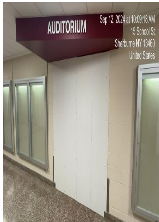
Auditorium Safety/Sound Barrier