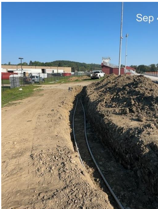
Conduit From Press Box to Scoreboard