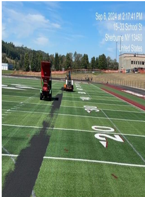
Final Layer of Infill