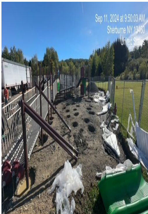
Cont. excavation and installation at playground