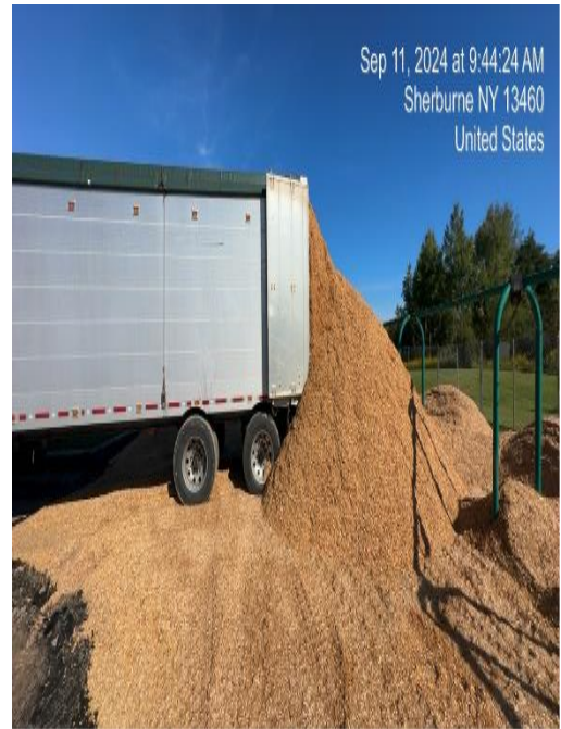
New Wood Chips at the Playground