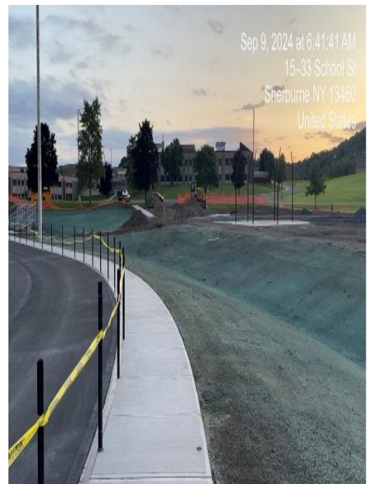
Hydro-Seeding Outer Areas