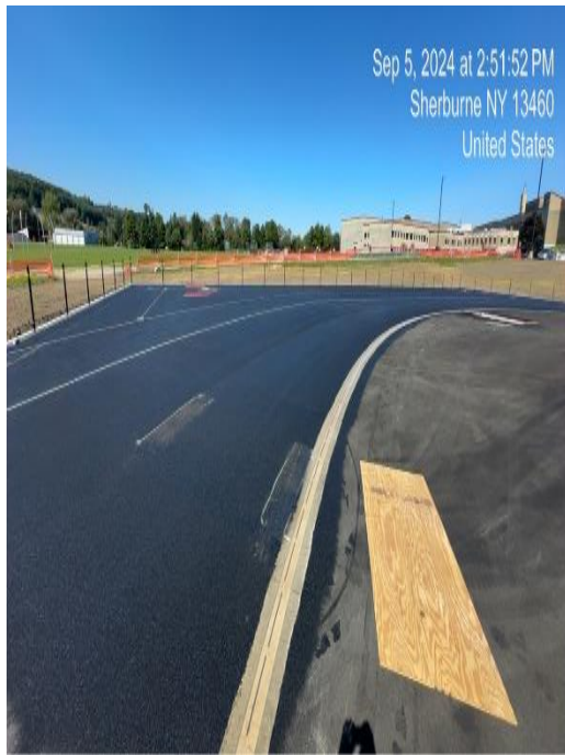
Final Asphalt Prep Before Surfacing