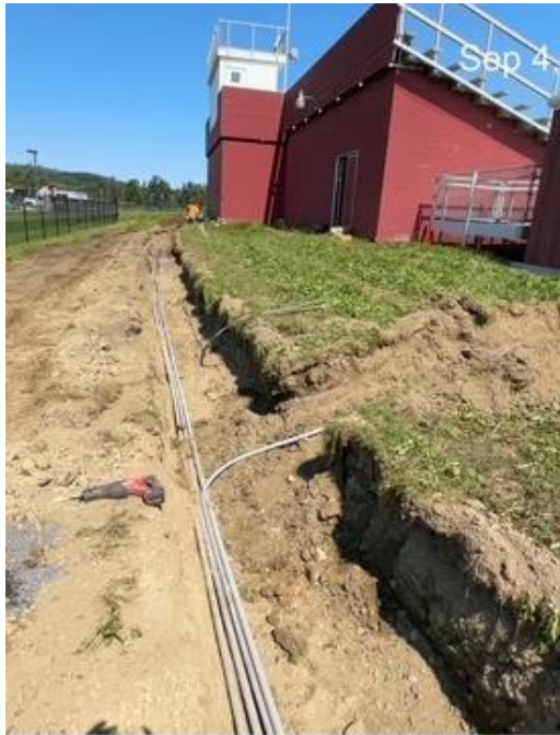
Conduit runs to Press Box and Storage Building