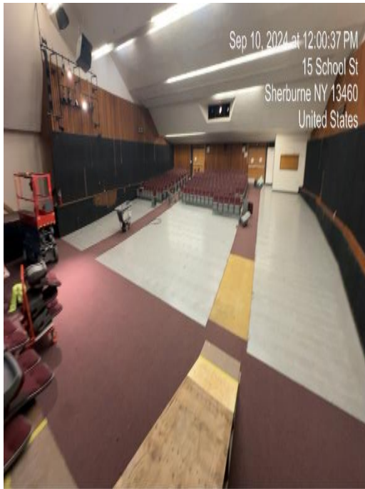
Auditorium Seating Being Removed