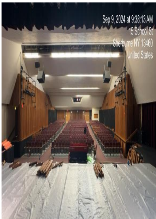
Stage Protection Installed Prior to Demo work