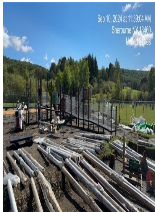
Playground Construction Underway