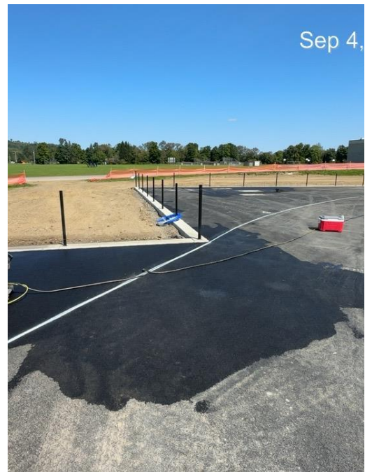
Prep Work to new Asphalt Track Base