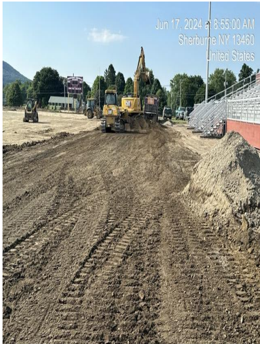
Track Subgrade Prep