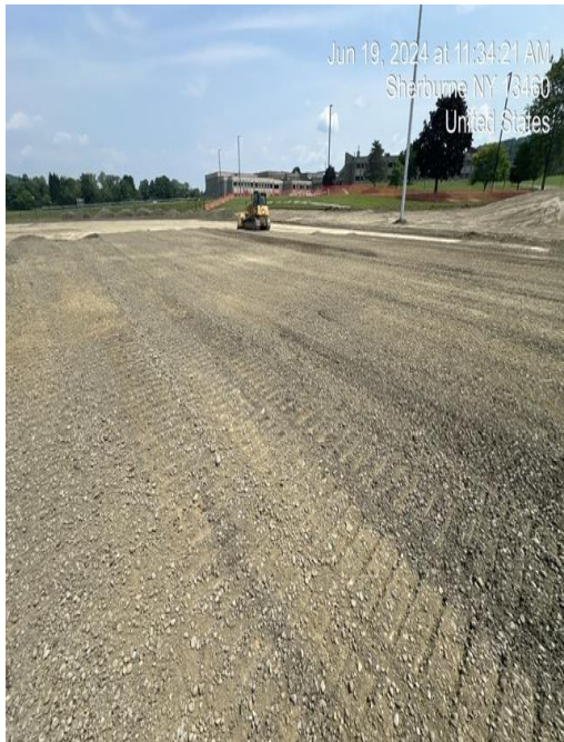
Subgrade Fine Grading