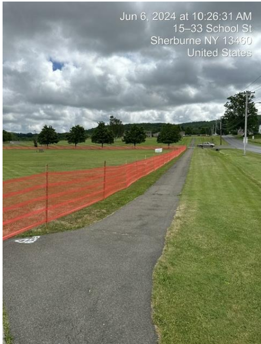
Construction Zone Perimeter Fencing