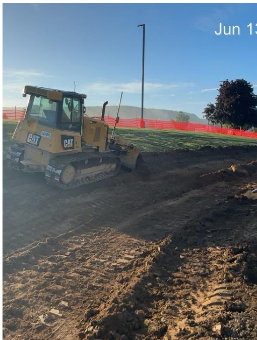
Outer Area Top Soil Ripping