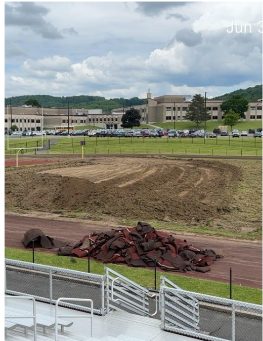
Athletic Field Top Soil Ripping