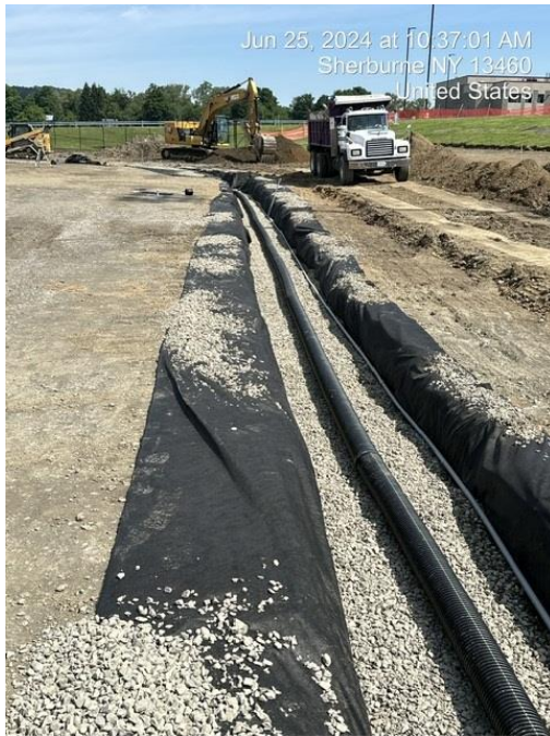
Storm Drainage and Conduit Install