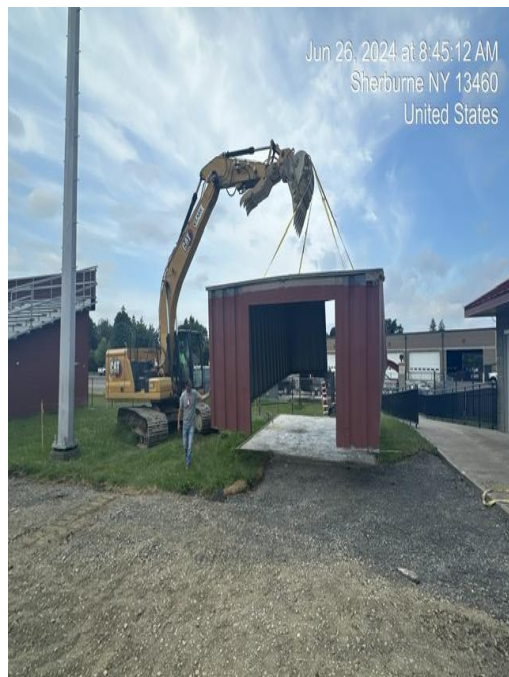
Storage Building Removed for Reuse