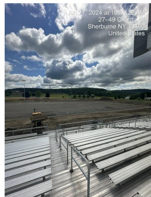
Current View of Construction