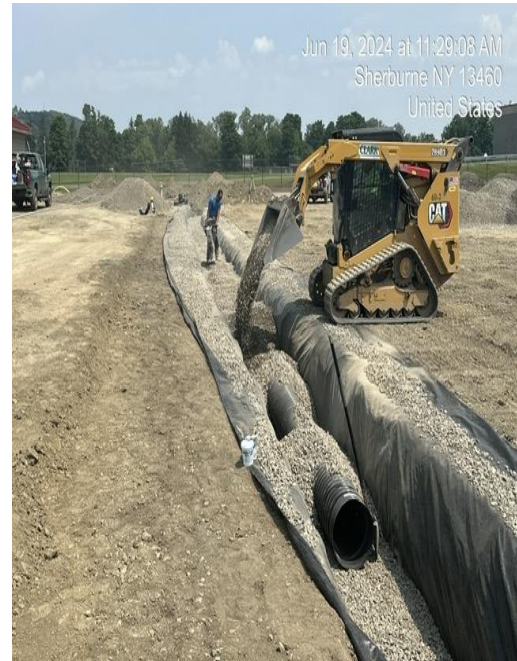
Perimeter Storm Drainage Install