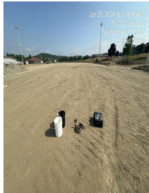
Field Subgrade Infiltration Testing