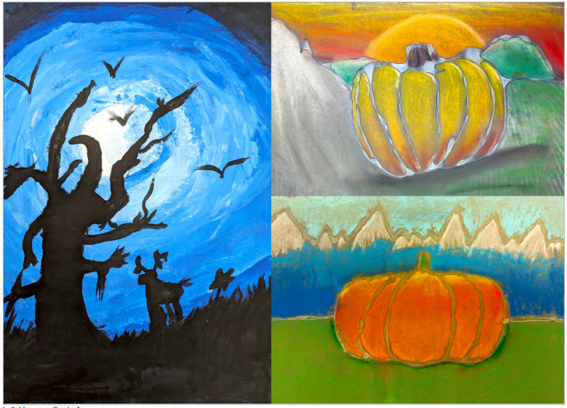
Left: Vanessa, Grade 4 Top Right: Brody, Grade 5 Bottom Right: Owen, Grade 5