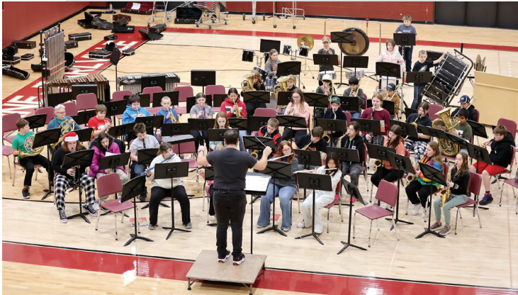
MIDDLE SCHOOL CONCERT