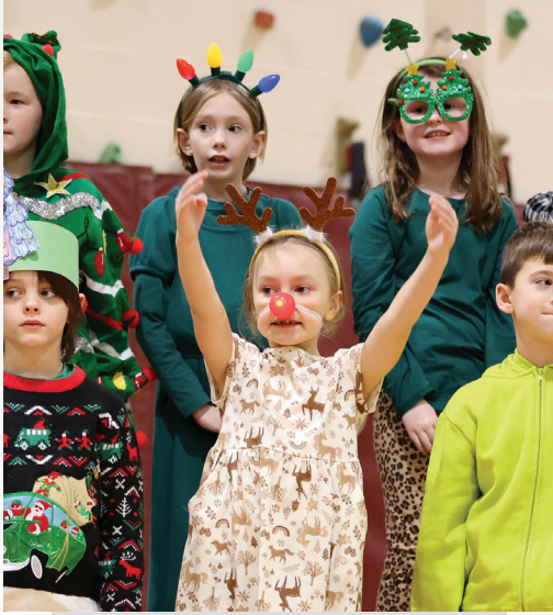
GRADE 1 CONCERT