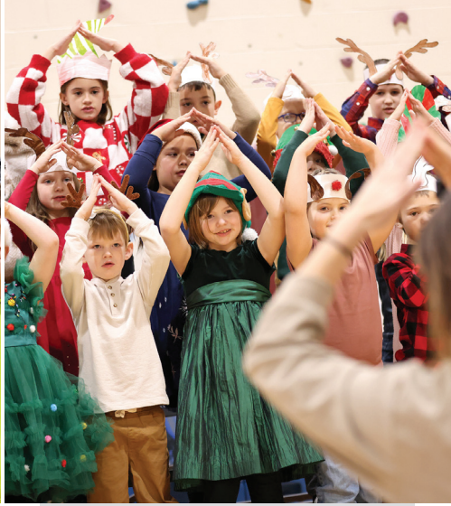
GRADE 2 CONCERT