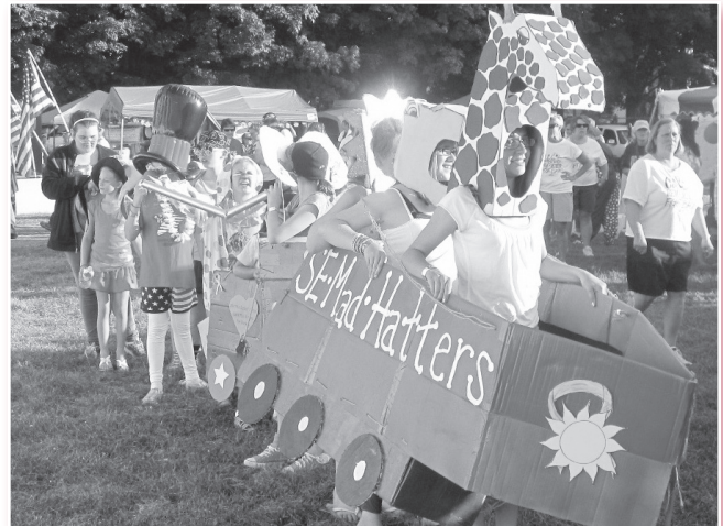
Students line up before the start of Relay.

As always, thank you so much for your support. For photos of this year's event, videos and information on joining us for the 2012 Relay for Life you can visit our Madhatters page at http://community.secsd.org/relay .