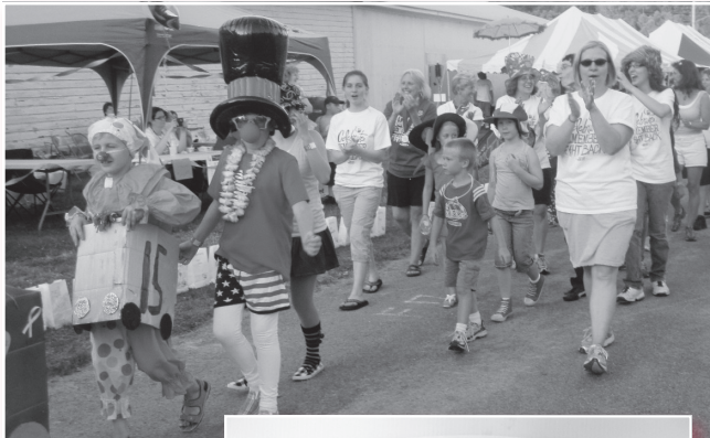
Team members walk around the track!