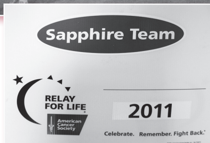
Our Sapphire level sign awarded to us from the American Cancer Society.