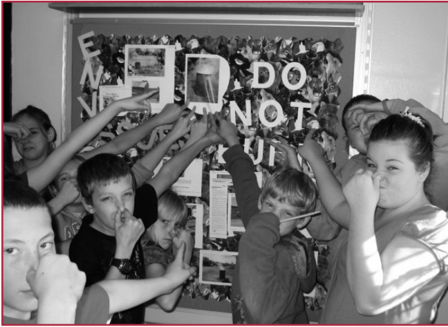
No more burn barrels bulletin board— Environmental Studies