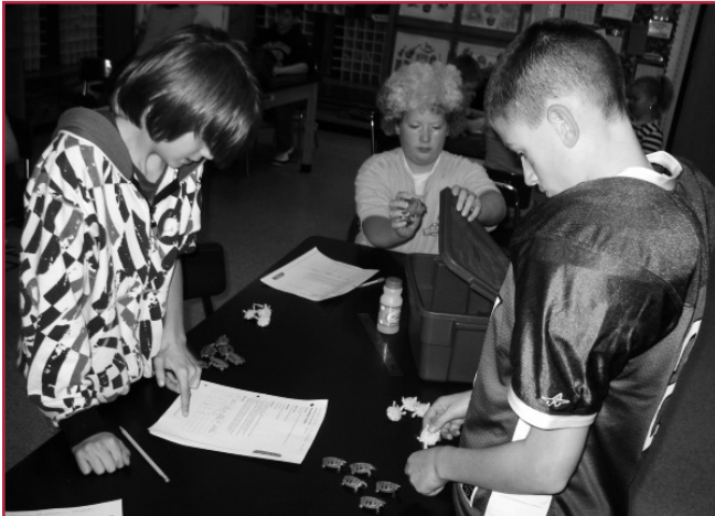
Studying population size/ Counting Turtles Lab—Grade 6 Science