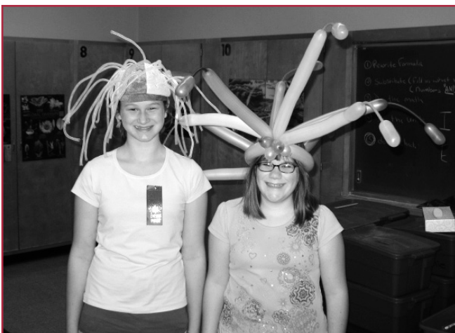
Hat Day in the Middle School